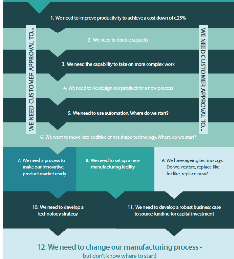
Fig 1.1: Scenarios typically faced by a small or medium business

Any business in one or more of these scenarios